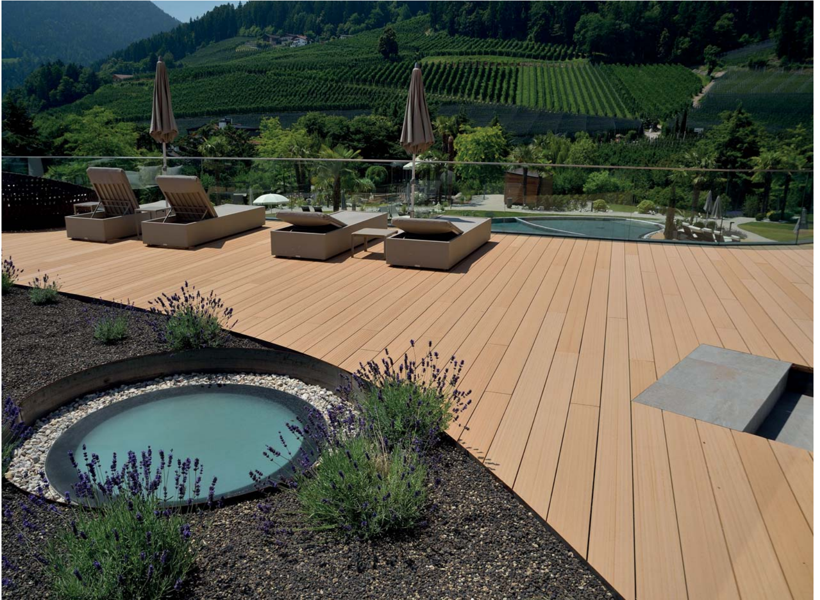
Alpiana Resort Merano (GREENDECK)